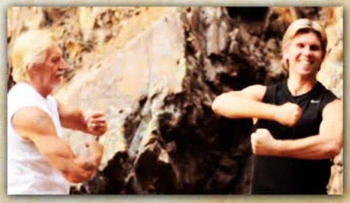
"Perceive that which cannot be seen with the eye." ~Miyamoto Mushashi