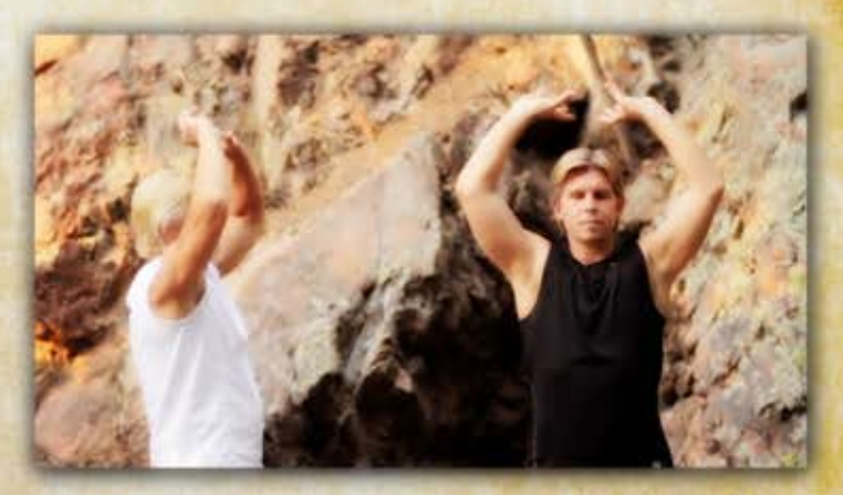
"Empty your mind, be formless, shapeless - like water" ~ Bruce Lee