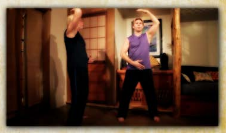
"Tension is who you think you should be. Relaxation is who you are." ~Chinese Proverb