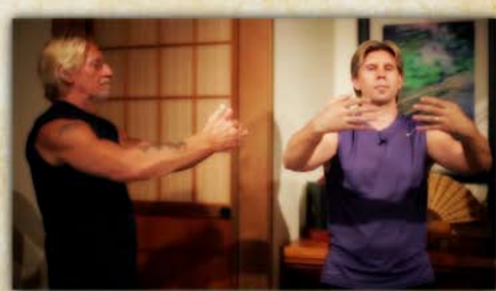
"A jug fills drop by drop" ~Buddha