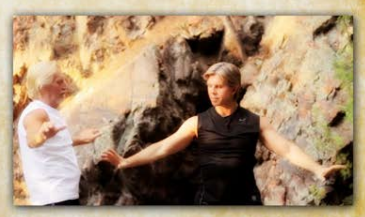
"The journey of a thousand miles begins with one step." ~Lao Tzu