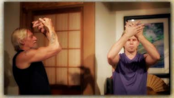
"If you correct your mind the rest of your life will fall into place." ~Lao Tzu